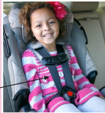
5-point adjustable harness

A car seat harness keeps a child properly restrained in the event of a crash and spreads crash forces across the strongest areas of the child's body (hips and chest).